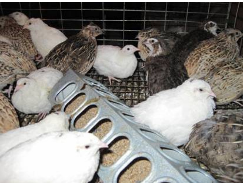
Left: Grow-out pen.

Because Coturnix are quite small at hatch, we blend the crumbles to a cornmeal consistency. This aids in their digestion and this is where the Jumbo Coturnix can grow to their potential. If one does not have a blender and a small amount of chicks to feed, a mortar and pestle will work. Oyster shell is also given to young birds in the form of calcium carbonate. This is ground up as well and offered in addition of the feed.