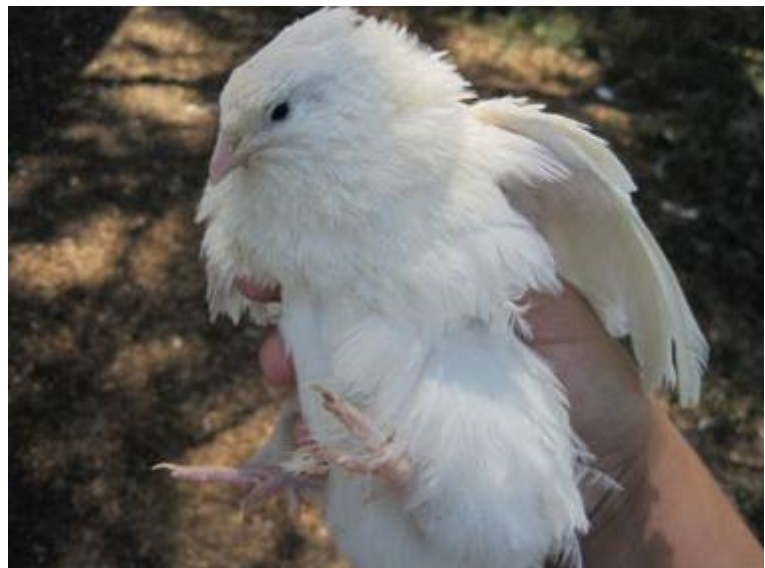
Right: English White Coturnix.