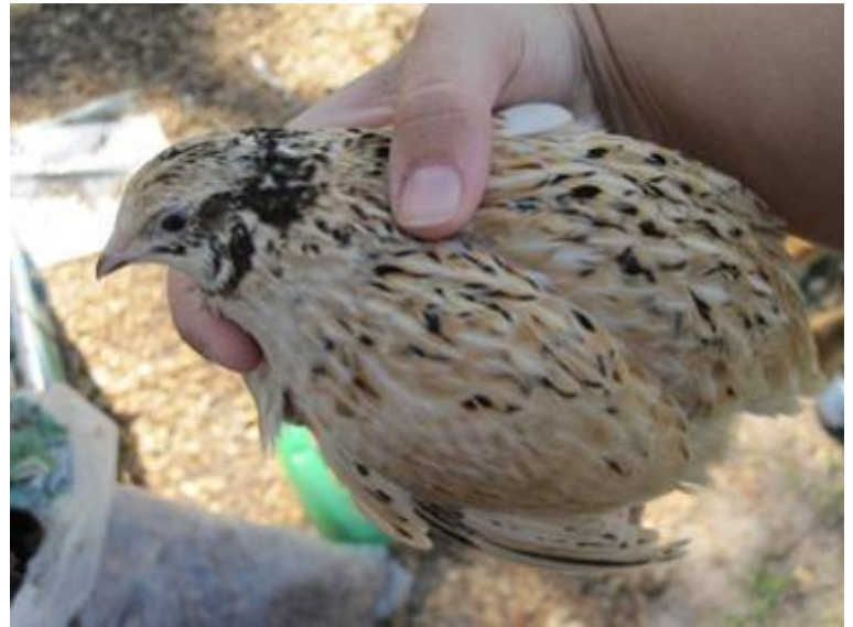
Left: Texas A and M Coturnix.