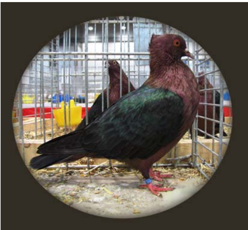
Left: Archangel, bronze black wing.