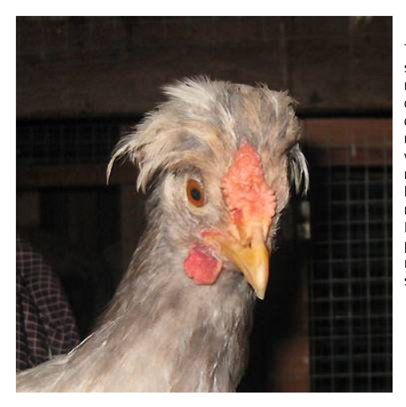
Above and right: All sorts of combs or even a crest.

Below: All kind of colours and markings.