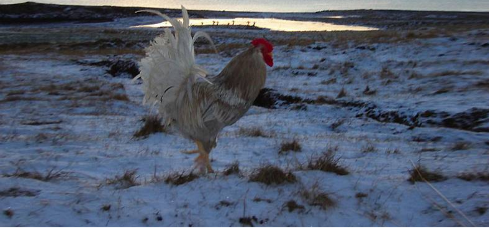
Above: Wintertime in Iceland.