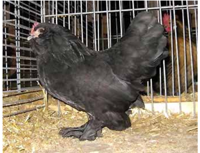
Below right: Uccle Bearded bantam, black pullet.