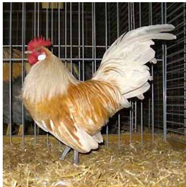
Left: This Twenste kriel cockerel in silver crele passed the test. (See also article in this issue.) Breeders: Hoornstra and Vlaardingerbroek.