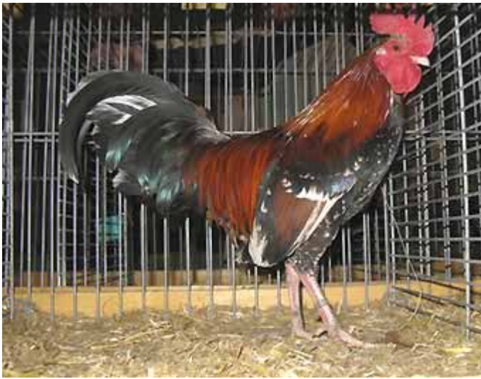
Left: Tournaisis (bantam) cockerel, spangled.