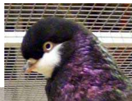
Right: Aviary with black Amsterdam Bearded Tumblers.

The Halls were decorated with many attractive aviaries with various fancy pigeon breeds.