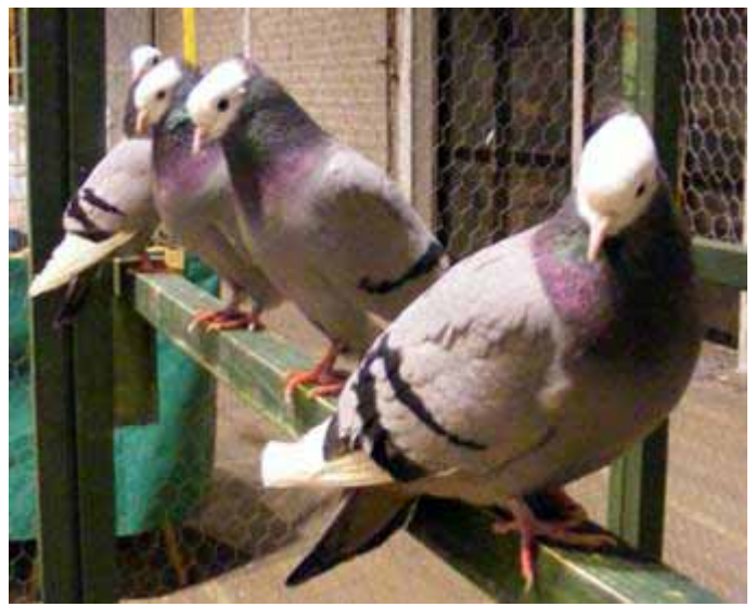
Rhineland Ring beater, blue black barred. Owner: G. Hoornveld.