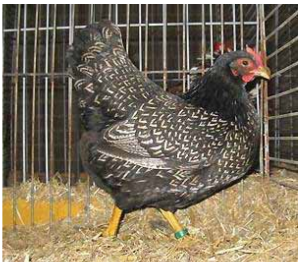
Left: A Barnevelder bantam pullet in silver double laced. This is also a completely new colour variety and recognised in 2009. Breeder: B. Beugelsdijk.