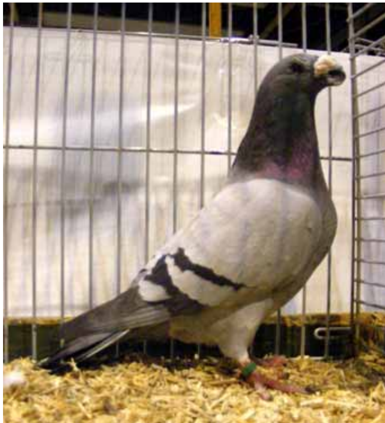
Below: Dragoon, blue black barred, f/o. Owner: J. Kort.