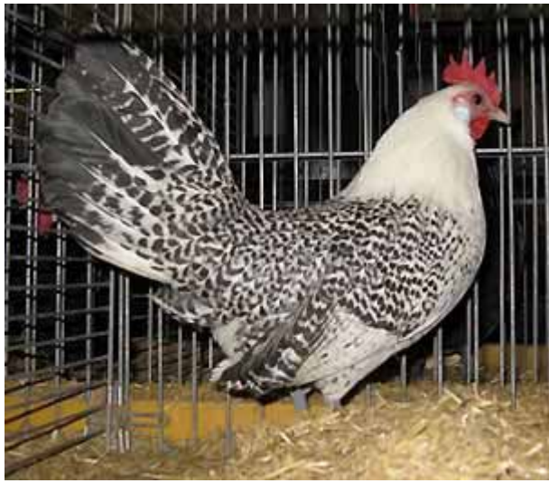
Left: Groningen Meeuw bantam, hen, silver pullet. Owner: Combination BeVo.