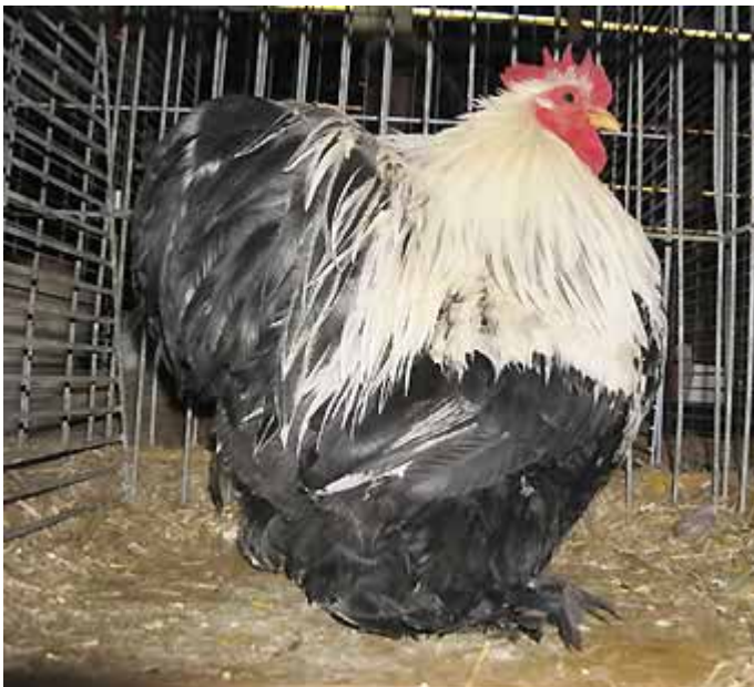
Left: Cochin bantam cockerel in the new colour variety silver crele.