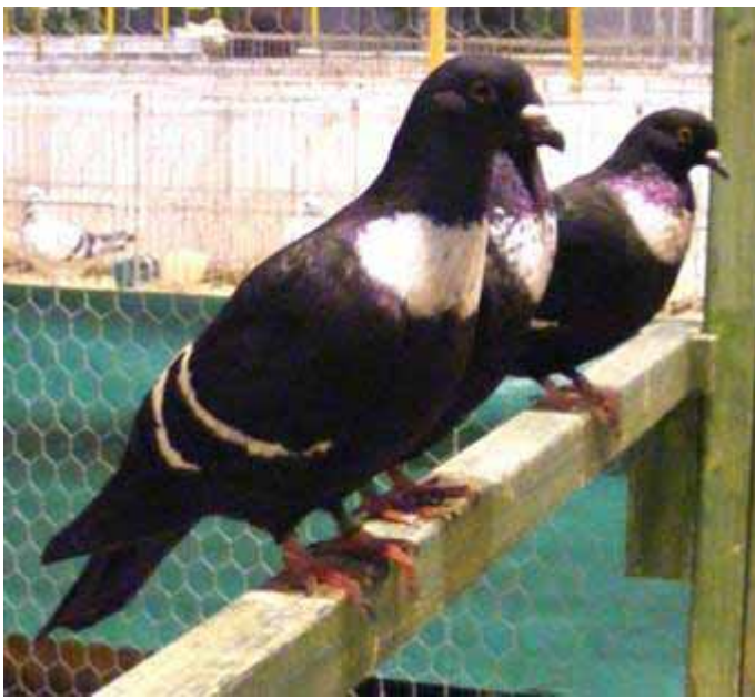
Starlings, black white barred. Owner: G. Hoornveld.