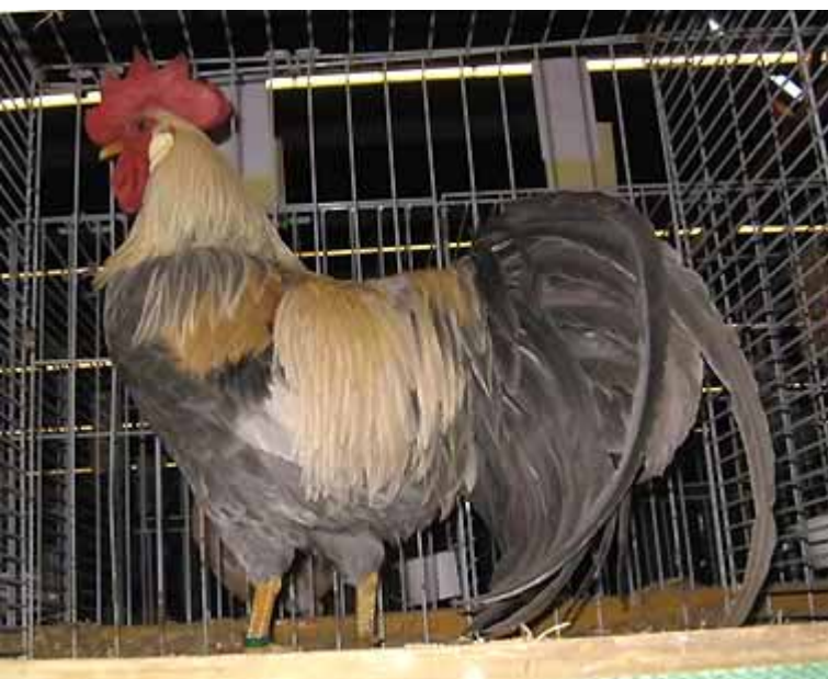
Left: Leghorn cockerel in lavender partridge. Recognised in January 2009. Breeder: H. Averdijk.