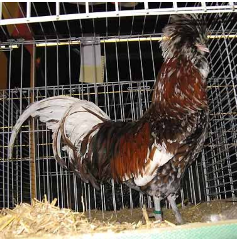
Left: Bearded Poland cockerel in the new variety: tollbunt. Recognised. Breeder: W. Diepenbroek.