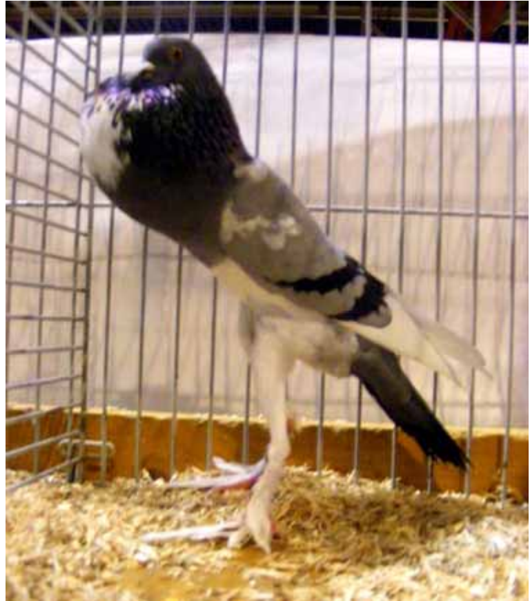
Right: Pygmy Pouter, blue blackbarred pied, young male. Owner: Combination The Pigeon.