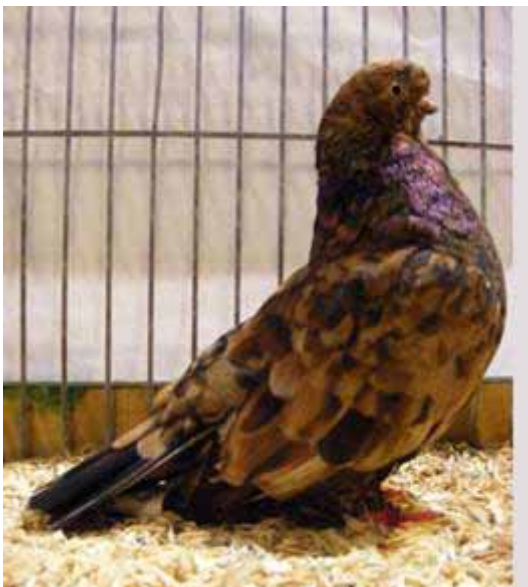
Left: English Shortfaced Tumbler, almond, old male. Owner: Comb. The Pigeon.