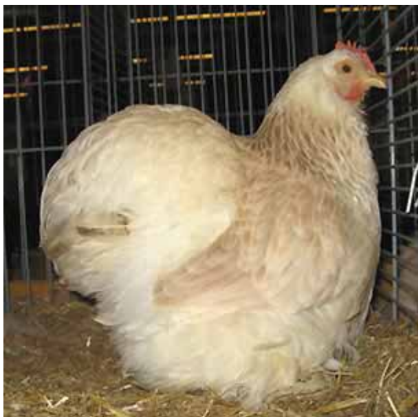
Also entered: Cochin bantams in lemon wheaten (cockerel left below) and silver wheaten (pullet right below), but those were turned down. Breeders: G. v.d. Oever and Van Hoof.