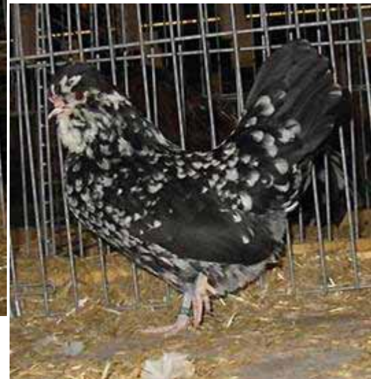
Above right: Right boven:

Watermaal Bearded bantam, mottled pullet.