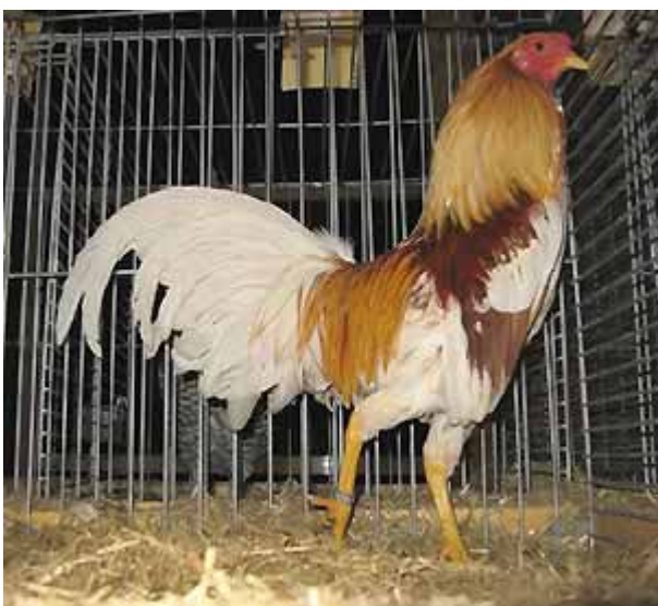
Left: Twentse kriel, cockerel, pile. Owner: Family Hoornstra.

For a short video, see http://nl.youtube.com/watch?v=zamAPOSZ8FM