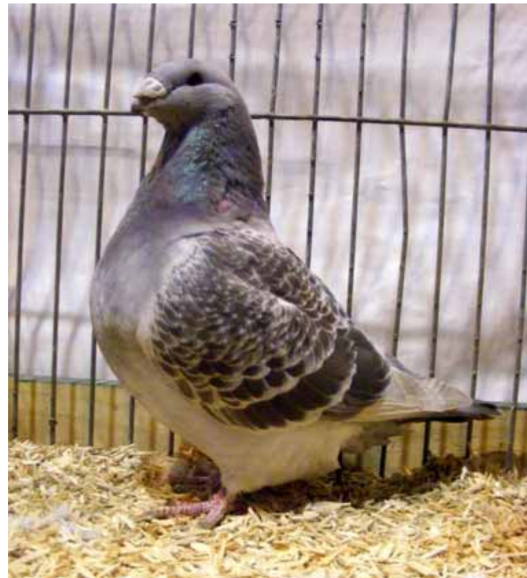
Above: Show Racer, silver checkered, old female. Owner: D.J.C. van Doorn.