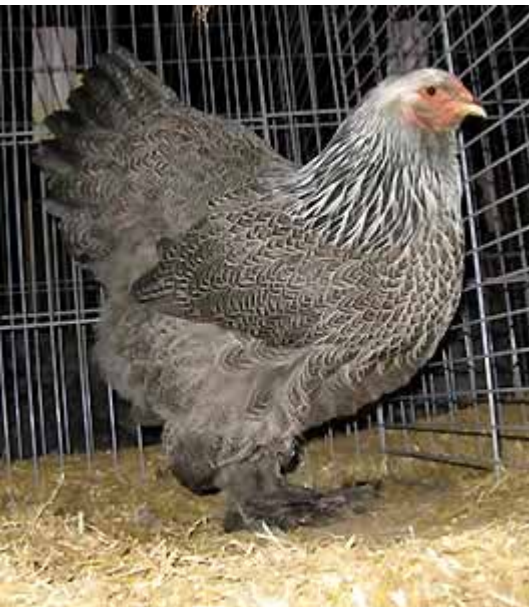
Right: Buff black columbia Brahma bantam pullet.