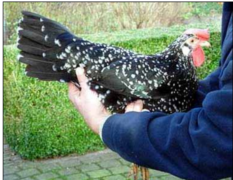
Left: Fine white 'pearls' instead of (not wanted!) lacing.