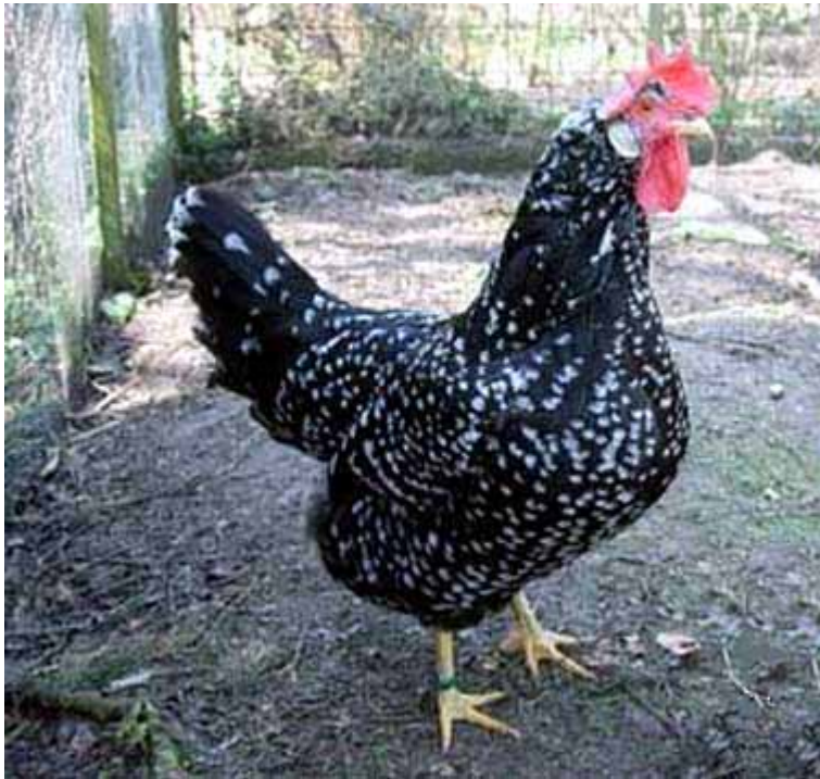
Left: An old hen with still outstanding white mottles.

Fortunately there are still different bloodlines in the Large Fowl and Bantams, although the level of inbreeding is increasing. Still, the quality of the breed is at its best if more unrelated strains continue to exist, and this would also be beneficial for newcomers who are willing to start with this historical breed.