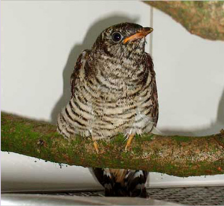
Above: The Cuckoo.

As the description implies, the name of this bluish barred colour pattern is given because it resembles a cuckoo. In the German language this colour is named ' gesperbert ', referring to the sparrow-hawk, which is similarly barred.