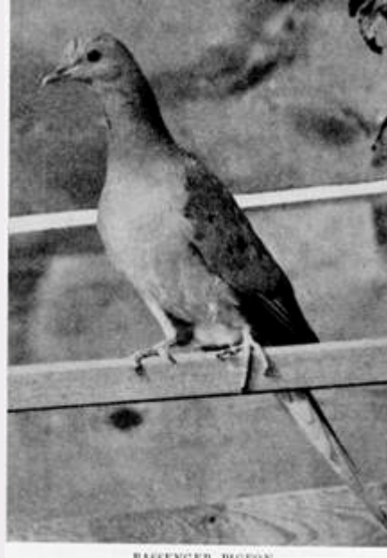
Left: The last male; right, Martha, the last female.

Naturalis Museum in The Netherlands has 11 mounted passenger Pigeons, which you can all admire 3D at http://ip30.eti.uva.nl/naturalis/detail.php?lang=nl&id=39