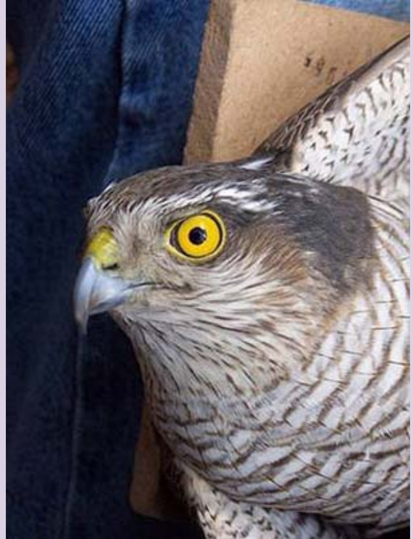
Right: The Sparrow hawk.