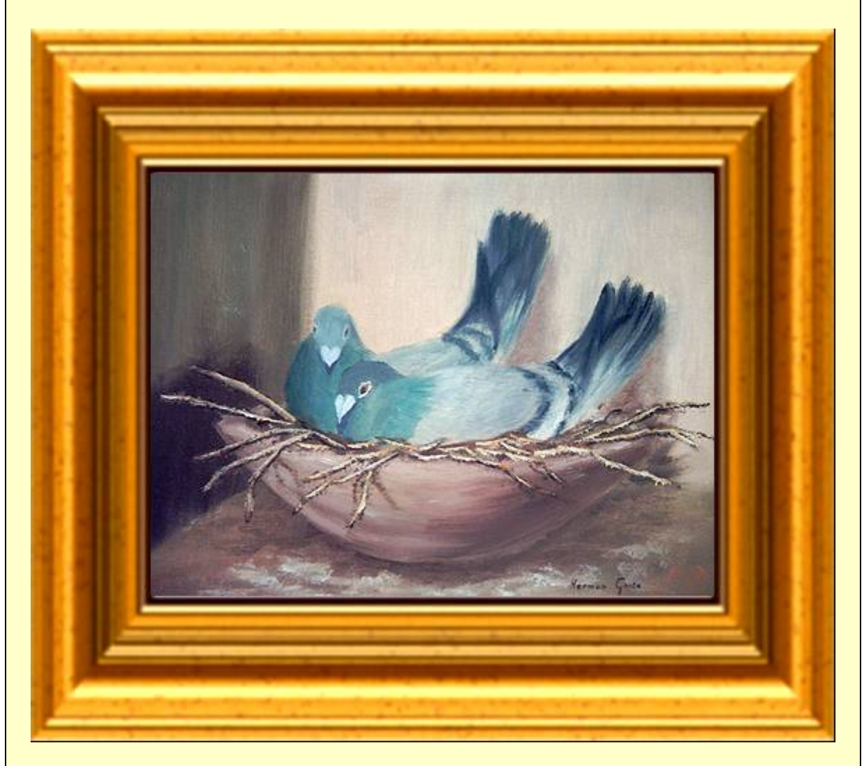
Take your chance to win a free subscription!

Every reader may GUESS which Fancy Pigeon breed is portrayed in 'The Frame'. Please mail your answer to <a href="mailto:redactie@aviculture-europe.nl">redactie@aviculture-europe.nl</a> stating: 'Answer The Frame'.