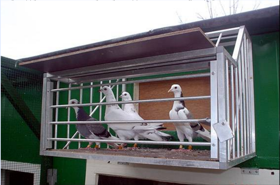
Photos of the Tipplers of Auke Halma. Mainly from the strain of Piet van der Werf. During the 4<sup>th</sup> old birds' match this year, the team flew 16.35 hrs. Look how the birds are blooming with health!

The team of H.G. v.d. Broek , 5 Tipplers, 2 blue, 2 blue pied and a blue grizzle, flew 8.21 hrs. They are young birds, not full-grown in wings, and they came down in a rainstorm. The 3 red white flights of H. de Jong flew 14.45 hrs, making him very happy, but unfortunately they disappeared in the night, pity!