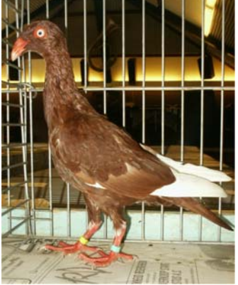
In third place, another pigeon from Henk Kromkamp, a Red White-Flight female, still moulting, but top-class!

You will find the pictures of the Young Animal Show at Twello on 10<sup>th</sup> of September 2005 on the web site of the Danish Tumblers Club Holland, follow the link: <u>http://www.homepages.hetnet.nl/~danske/twello05.htm</u>