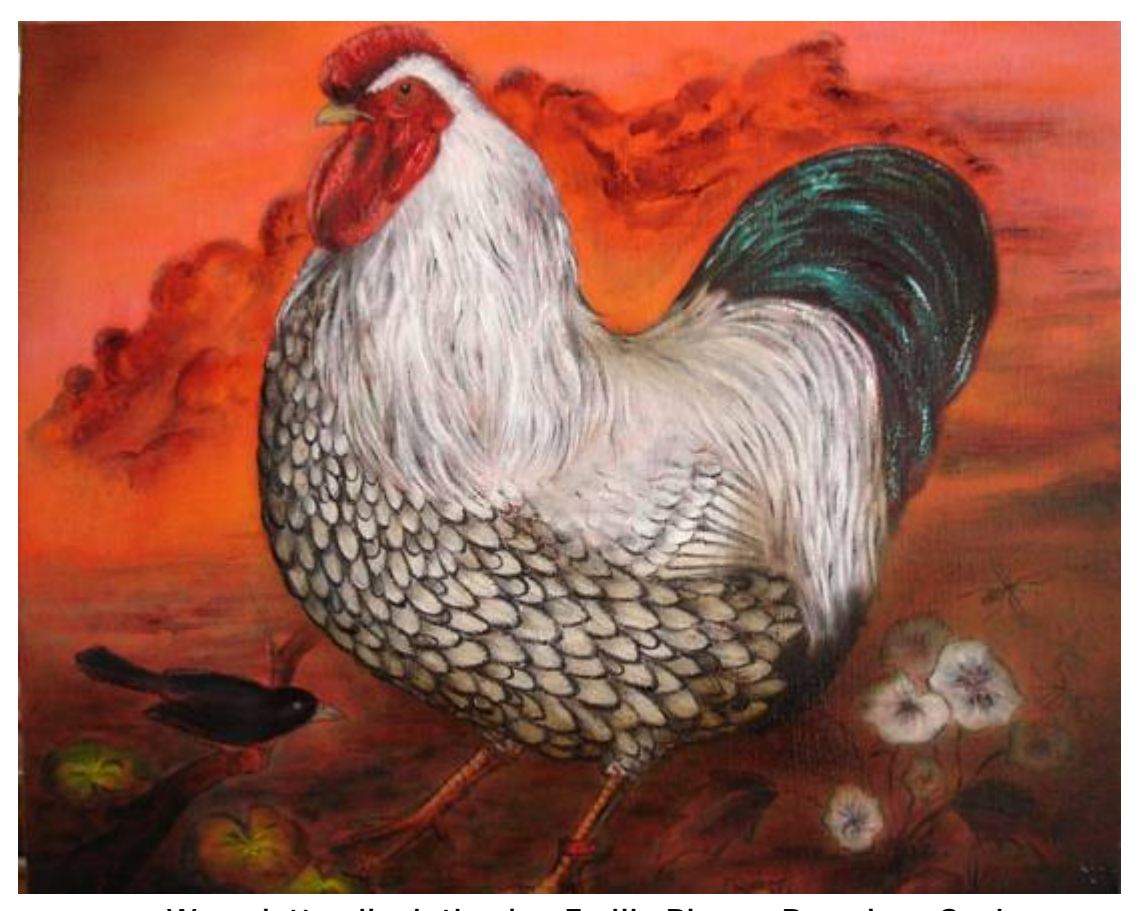
Wyandotte oilpainting by: Emilio Blasco, Barcelona Spain

For more information, the secretary of the Dutch Color Pigeon Breeders club is: S. Broersma, Pastoryleane 41, 8804 SB Tzum, Netherlands.